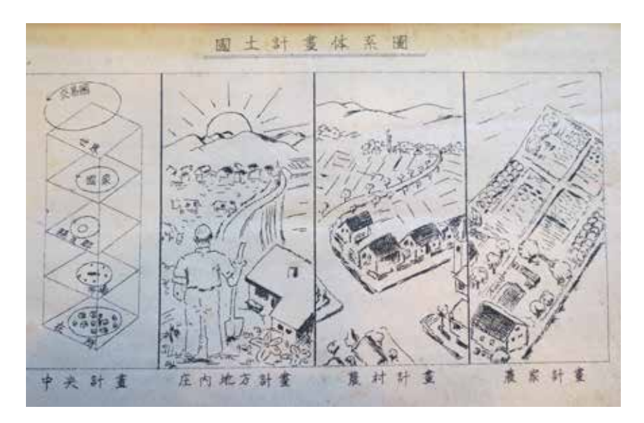
FIGURE 2. Envisioning the reform of the Shōnai region, from right to left: the ideal farmer's house, the farmer's village, the Shōnai region, within the country and the wider world. From Shōnai kokudo keikaku sōan (1943).