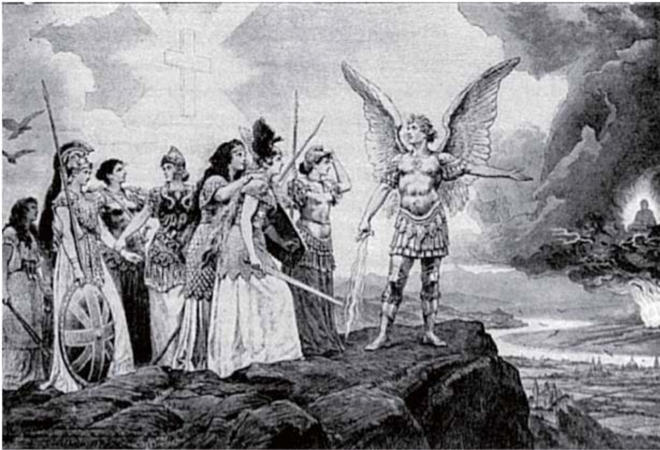
FIGURE 2. Völker Europas, wahrt eure heiligsten Güter (reproduced from Auffart 2002).

Furthermore, in the very same letter, the Kaiser places the illustration in the context of the Tripartite Intervention, when Germany, Russia, and France forced, through diplomatic means, Japan to relinquish the Liaodong Peninsula, which it