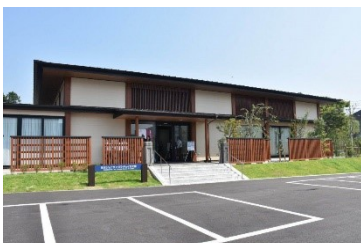
Main Venue: Jonathan KS Choi Cultural Center (No. 76 on the map above)